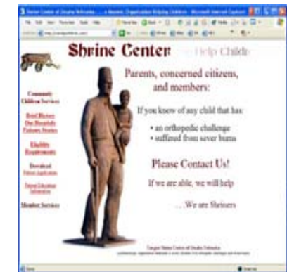
Tangier Shrine Center Children can learn, get help and apply online!