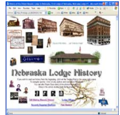
The Nebraska Lodge History website picture tour of our first 150 Years!