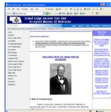
The Grand Lodge of Nebraska website Lodge website links, News and events!