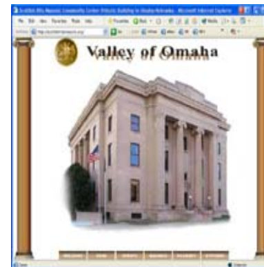
Scottish Rite Masonic Center Website Tour! Get local events and more!