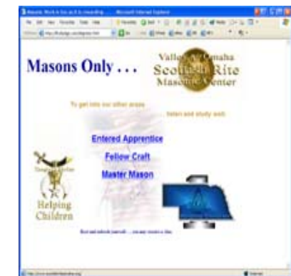
Nebraska Lodge website composite site Quick link to all bodies and degrees!